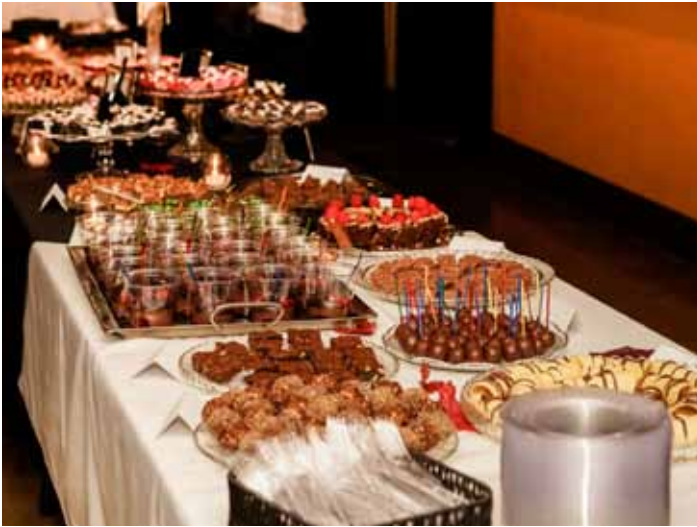
Typical table of chocolates at "Chocolate Fest."

Circle October 8 th on your calendar for the sixth McFarland Chocolate Fest that promises to be the best yet. Held in the Curling Club at 4802 Marsh Road in McFarland from 7 to 9 PM, this elegant evening of candlelight, champagne (and other beverages) - and more yummy chocolate desserts than you can imagine - will be a fun-filled and memorable evening. Who will be the featured baker? Who will be the celebrity hosts? Who will provide the live music? What new chocolate delights await us? What great gifts will fill the silent auction table? Come and find out and support the Larson House Museum so we can keep the lights on, the temperature comfortable and the doors open for our many guests.