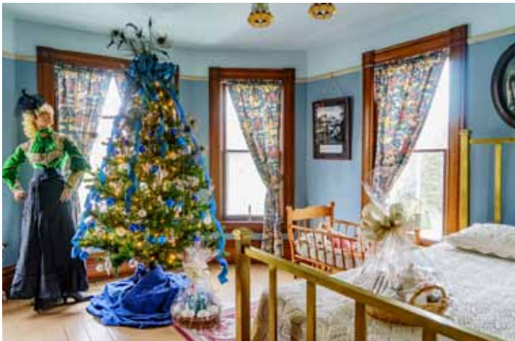
The master bedroom all decked out for Christmas.