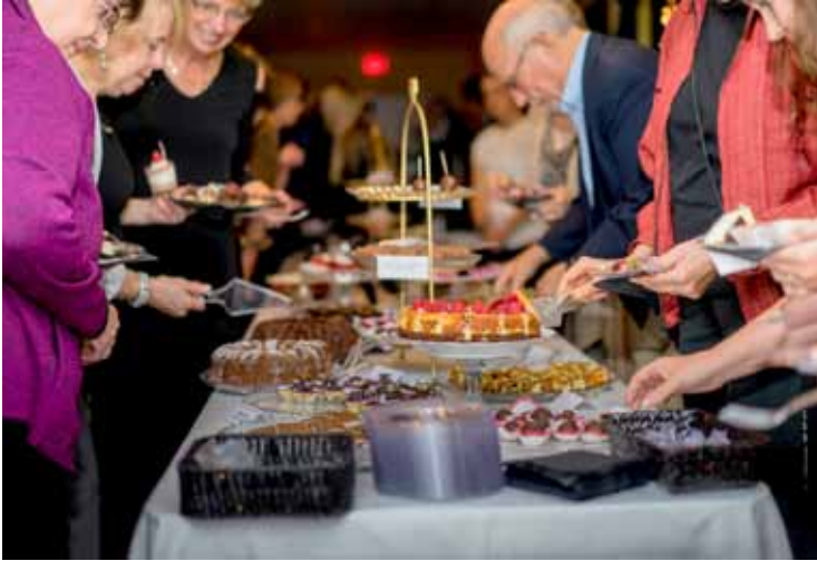
The main chocolate table was a real treat.

Imagine an array of dreamy, dark, decadent chocolate desserts, soft candlelight, glistening champagne and lovely music – this is the ambiance of the famous McFarland