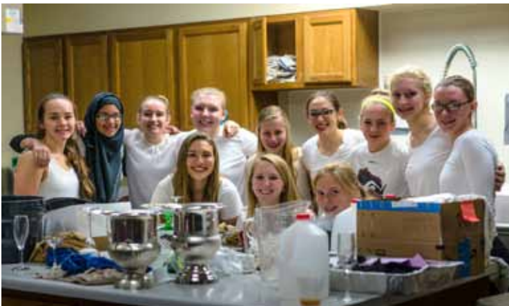
The McFarland Ambassadors in the kitchen. They also bused the tables.