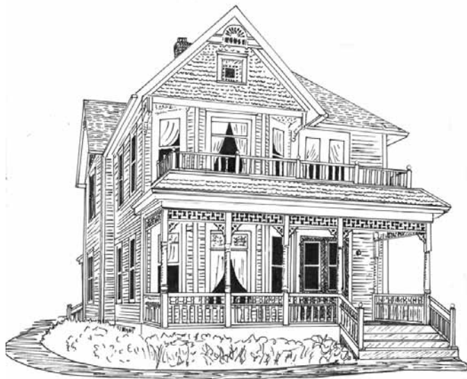
The Larson House