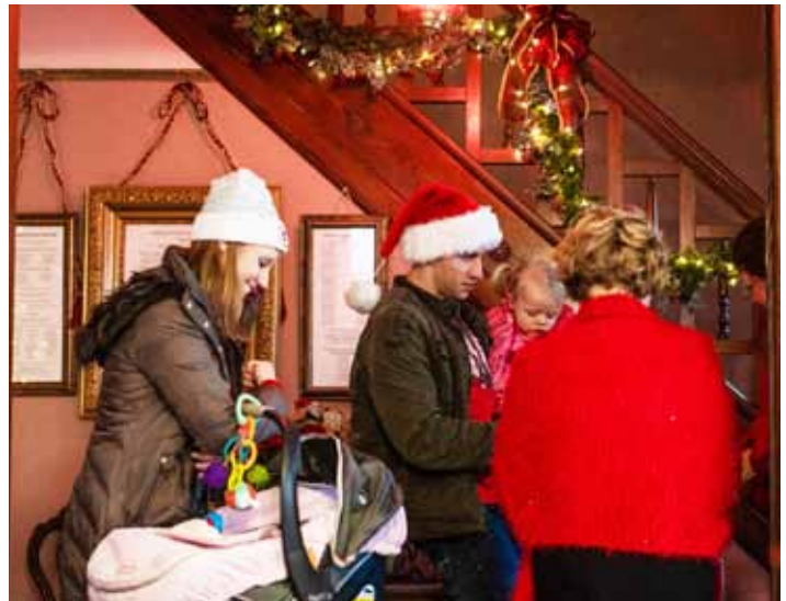
Many families came to see the Christmas decorations at the Larson House.